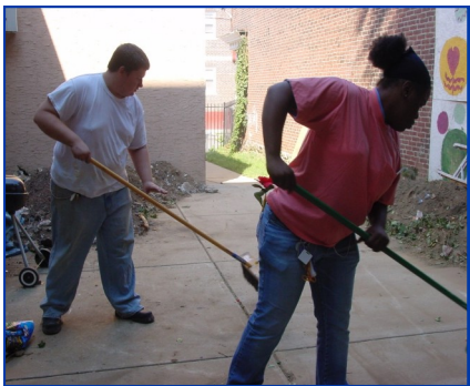
Job Corp members clean up at Dignity II.