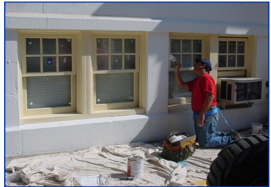
A Job Corp member paints at Dignity II.